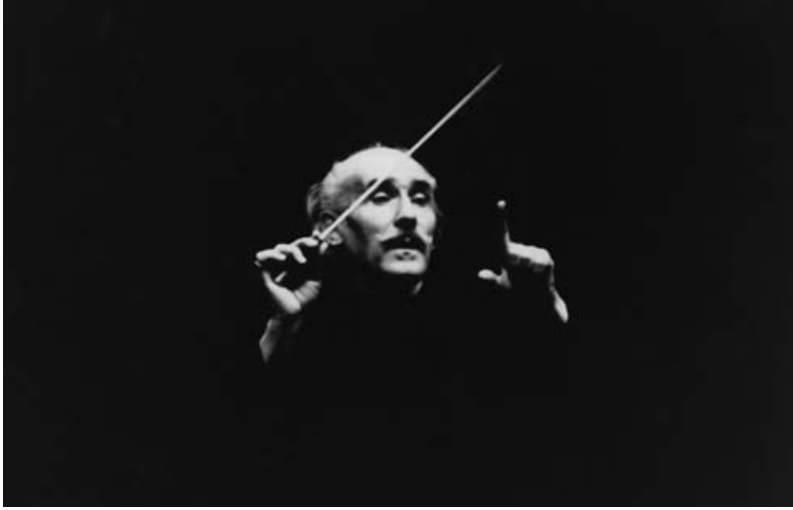
Figure 1 Arturo Toscanini.

In some of these images it is as if the conductors themselves take on the appearance of imagined spirits, all but disembodied, with only their most salient features evident. Principal among these is the highly symbolic baton – itself possibly related subliminally to the wizard’s wand in the collective mind of the audience – and the hands that are so prominent in the performance of the dance. The face is also important, since through it we register our impressions of the musical spirits controlled by or possessing the shaman (see Figures 1 and 2). Such images, emphasizing the ethereal darkness within which we imagine the conductor operates, strongly suggest him to be a liminal, disembodied, almost ghost-like figure, a figure, in fact, who may very well be caught between this world and another.