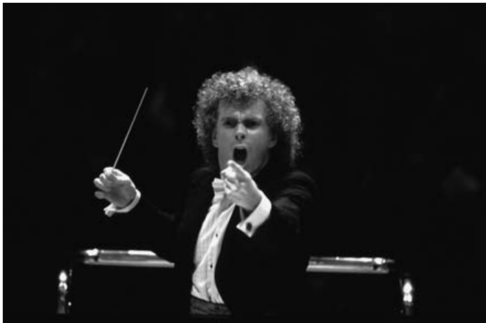
Figure 3 Simon Rattle.

In other images, however, the self-evident corporality of the conductor demonstrates something of the strenuous demands placed upon him as he dances. While the English word ‘dancing’ will for many bring with it associations of light-hearted pleasure, the conductor’s execution of his task may lead to facial expressions and postures that could be read as conveying quite different meanings (see Figures 3–5). These images, ostensibly of passion perhaps but equally valid if taken as grimaces of pain, suggest the physical discomfort experienced by the shaman as he plays out the musical tensions that he takes symbolically into his body. The sweating brow and tousled hair remind us that this is hard physical work,