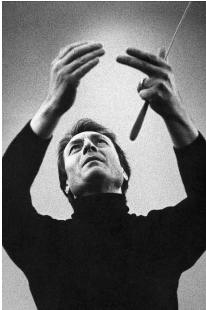
Figure 6 Carlo Maria Giulini

Of all those participating in the event it is this presiding figure who is most keenly aware of its solemnity and quasi-religious significance. Like other shamans, not only do conductors rely on music and dance for the efficacy of their performance, they must also occasionally offer what may seem like prayers, or at least supplication, to the musical spirits they entertain (see Figure 6). Through such gestures the conductor marks out the sanctity of the event, affirming the creation of a ritual space wherein communication with the musical spirits may be established. And as Rouget observes, dance is ‘above all, communication – with oneself and with others’. 69