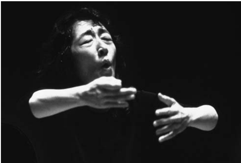
Figure 2 Mitsuko Uchida.

In some of these images it is as if the conductors themselves take on the appearance of imagined spirits, all but disembodied, with only their most salient features evident. Principal among these is the highly symbolic baton – itself possibly related subliminally to the wizard’s wand in the collective mind of the audience – and the hands that are so prominent in the performance of the dance. The face is also important, since through it we register our impressions of the musical spirits controlled by or possessing the shaman (see Figures 1 and 2). Such images, emphasizing the ethereal darkness within which we imagine the conductor operates, strongly suggest him to be a liminal, disembodied, almost ghost-like figure, a figure, in fact, who may very well be caught between this world and another.