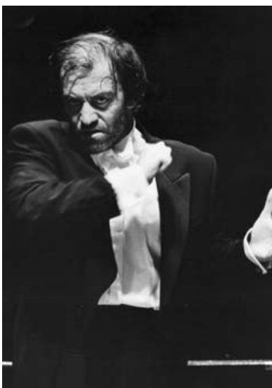
Figure 4 Valery Gergiev