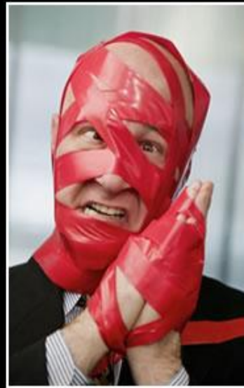
What PIs think we do