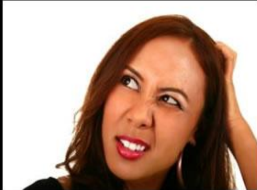
What our families think we do