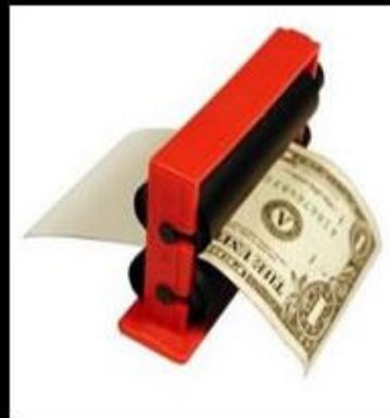
What our bosses think we do