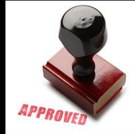
What deans/directors think we do