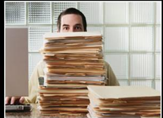
What we actually do