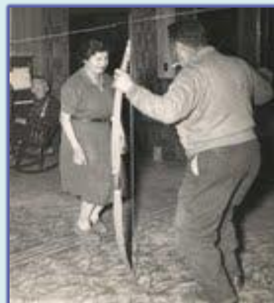
Figure 3: Native American couple performing traditional Irish dance

For further research, it would be interesting to conduct individual case studies to give further merit to the broad conclusion. I also would like to talk to Native American descendants directly and explore further overlap with Native and Irish communities on the Island (Figure 3)