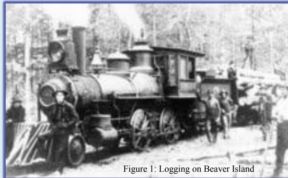
Figure 1: Logging on Beaver Island

Many full time loggers were not from the established island population. Natives and locals incorporated logging into seasonal occupations. Doing more than one thing to survive reflects the identity as an islander more-so than identity tied to specific occupation.