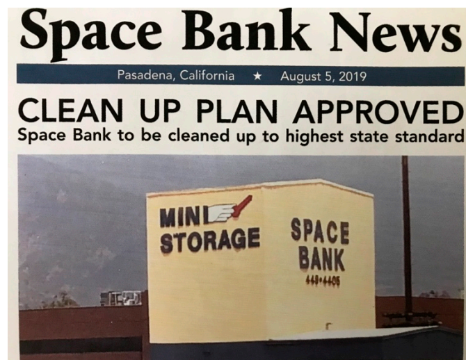
Figure 3. Photo of the first page of a CBRE/TCC brochure, mass mailed to thousands of Pasadena, California residents, that contradicts the cleanup standards contained both in the official CBRE/TCC site documents and in the Covenant Not to Sue that CBRE/TCC negotiated with the state regulator.

CBRE/TCC also repeatedly made this highest-cleanup-standards claim to the public, at multiple Pasadena City Council meetings and on electronic media. For instance, at the audio-recorded and TV-broadcast Pasadena City Council meeting of 9 July 2018, before the city approved CBRE/TCC’s site cleanup/redevelopment, CBRE/TCC officials said “The project will also safely clean up the site to the highest applicable regulatory standards . . . [and] will not allow any development to occur on the site unless it’s cleaned up to the highest residential standards” [64]. Although there are many other examples, similar to those in the preceding paragraphs, the instances above give a sense of the way CBRE/TCC appears to spread health misinformation through both traditional and social media.