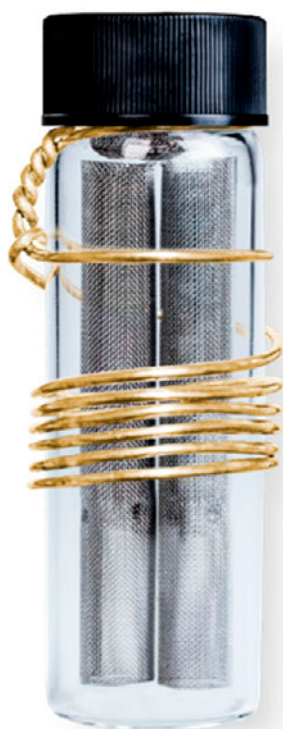
Figure 2. Beacon Passive Soil Gas Sampler.

Beacon Environmental Services, Inc, the undisputed US leader in passive soil-gas sampling and analysis < beacon-usa.com/ > (accessed on 28 March 2021; see the authors' Chapter 2 in the online Supplemental Materials)—supplied both the 12 sampler-tubes used for this study and analyzed them in its laboratory in Forest Hill, Maryland. Its 12 passive samplers are \frac{1}{4} -inch in diameter and 4.5-inch in length, packed with a Beacon proprietary sorbent that targets indoor-air, chlorinated VOCs over a two-week period (see the authors' Figure 2).